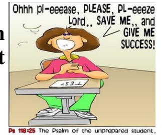
Ps 118:25 The Psalm of the unprepared student.